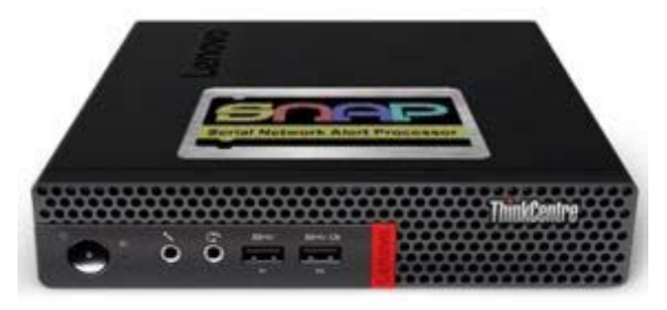
Rauland SIP Input Block (STG MODE)