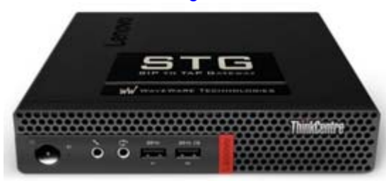
The New STG PLUS