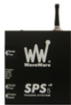
SPS-5 Paging System