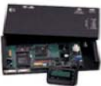
API-8 / 232